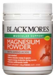
Magnesium powder supplement