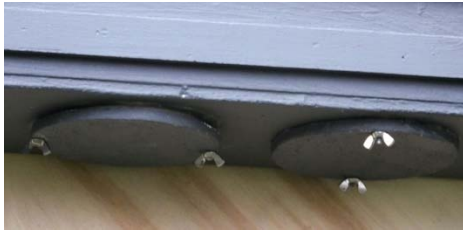
MacCup© Nesting cups easily removed

We manufacture commercial and bespoke nesting boxes for: Birds; Bats; Mammals and Insects