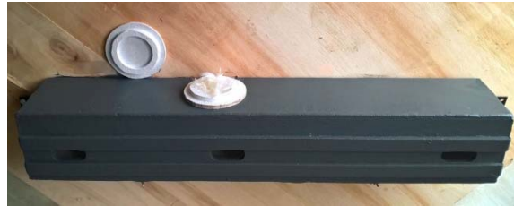
MacCup© nesting cups are feathered as standard

Introducing the new range of Genesis Wild Life Nesting Boxes , manufactured in Ireland, the nesting boxes offer value for money as well as many features not found in any other commercial nesting box.