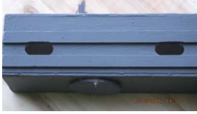
Genesis Swift Box

We manufacture commercial and bespoke nesting boxes for: Birds; Bats; Mammals and Insects