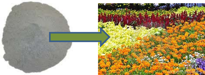
Magnesium powder assists plant photosynthesis