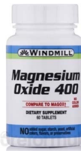
Magnesium Oxide Supplement