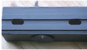
Genesis Swift Box

We manufacture commercial and bespoke nesting boxes for: Birds; Bats; Mammals and Insects