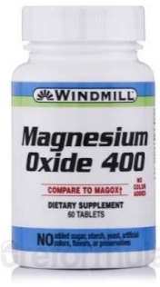
Magnesium Oxide Supplement