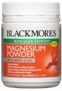
Magnesium powder supplement