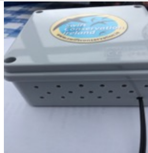
Make sure speaker is positioned with drilled holes facing downwards.