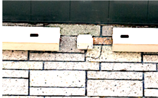
Example of best location for speaker box

NOTE : DO NOT ATTACH THE SPEAKER BOX TO THE NEST BOX