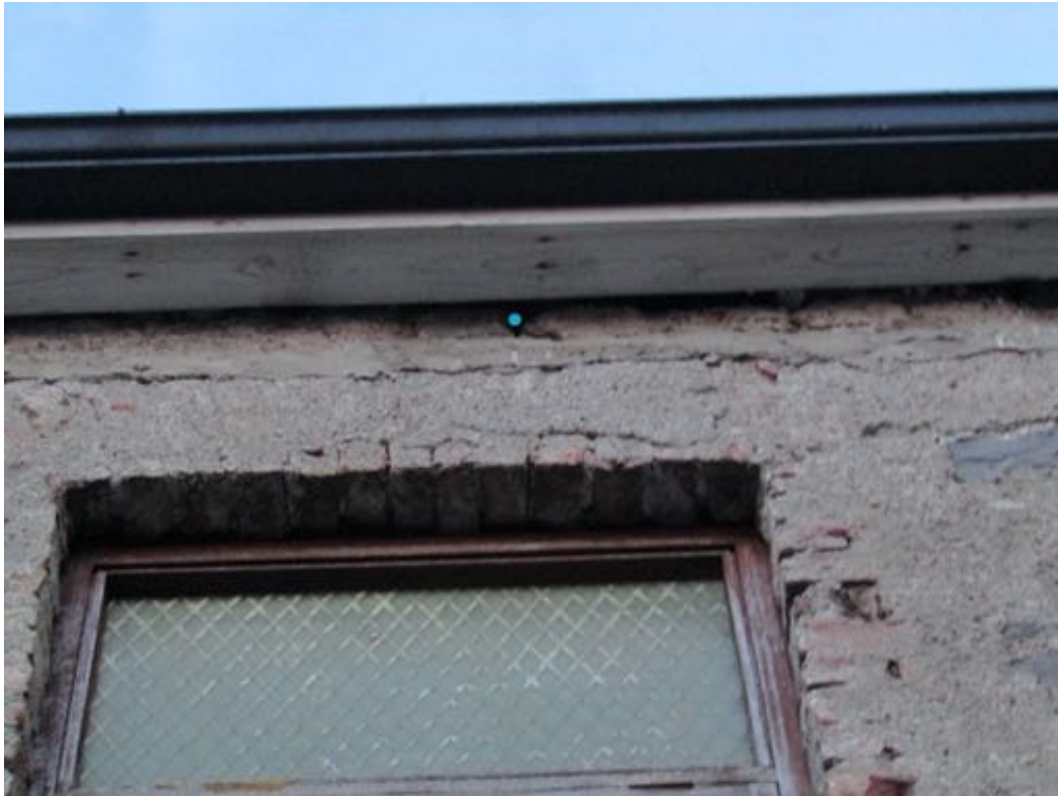
Nest Number 12, Youth Centre (exact).