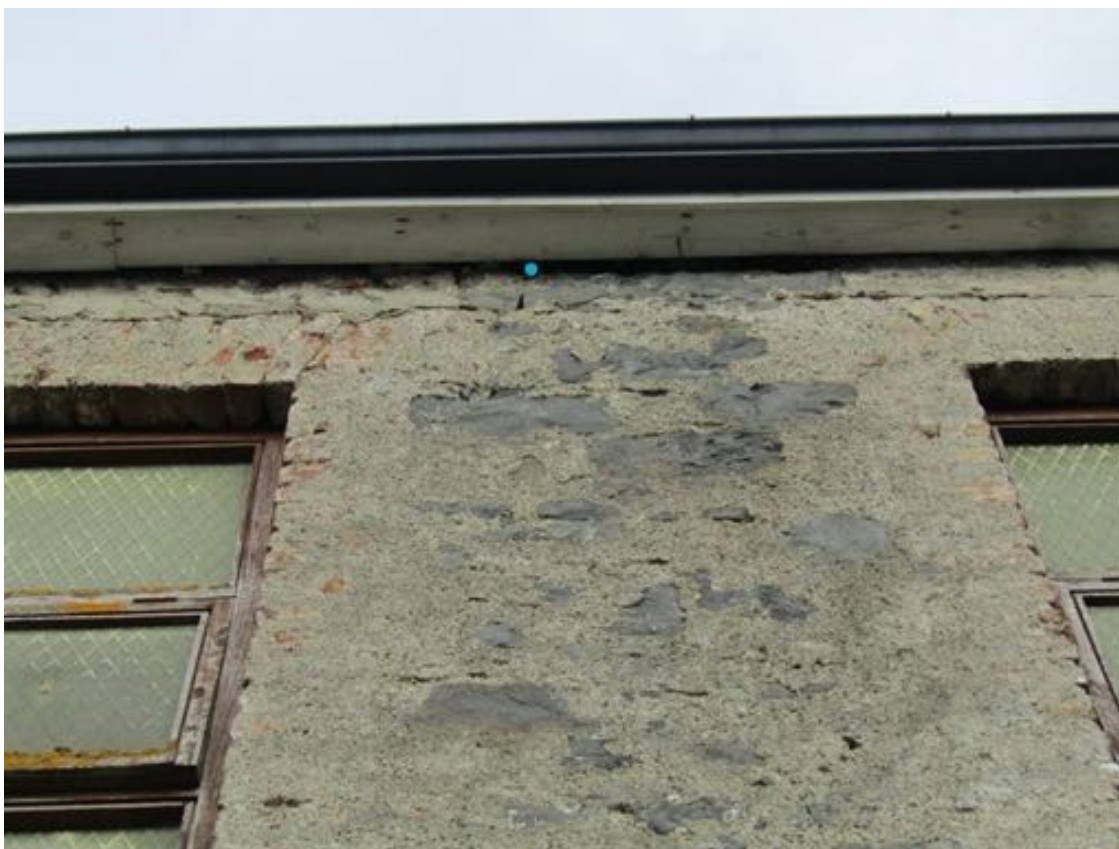
Nest Number 11, Youth Centre (exact).