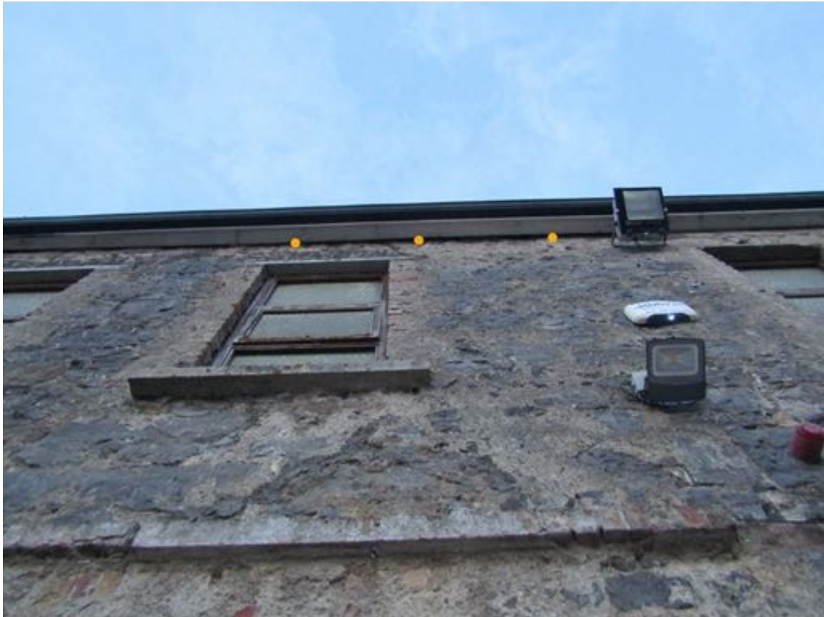
Nests 6,7,8, Youth Centre.