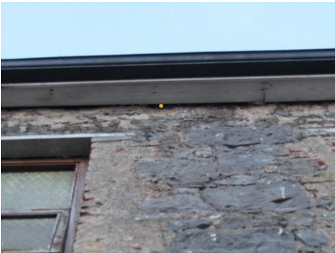
Nest Number 5, Youth Centre.