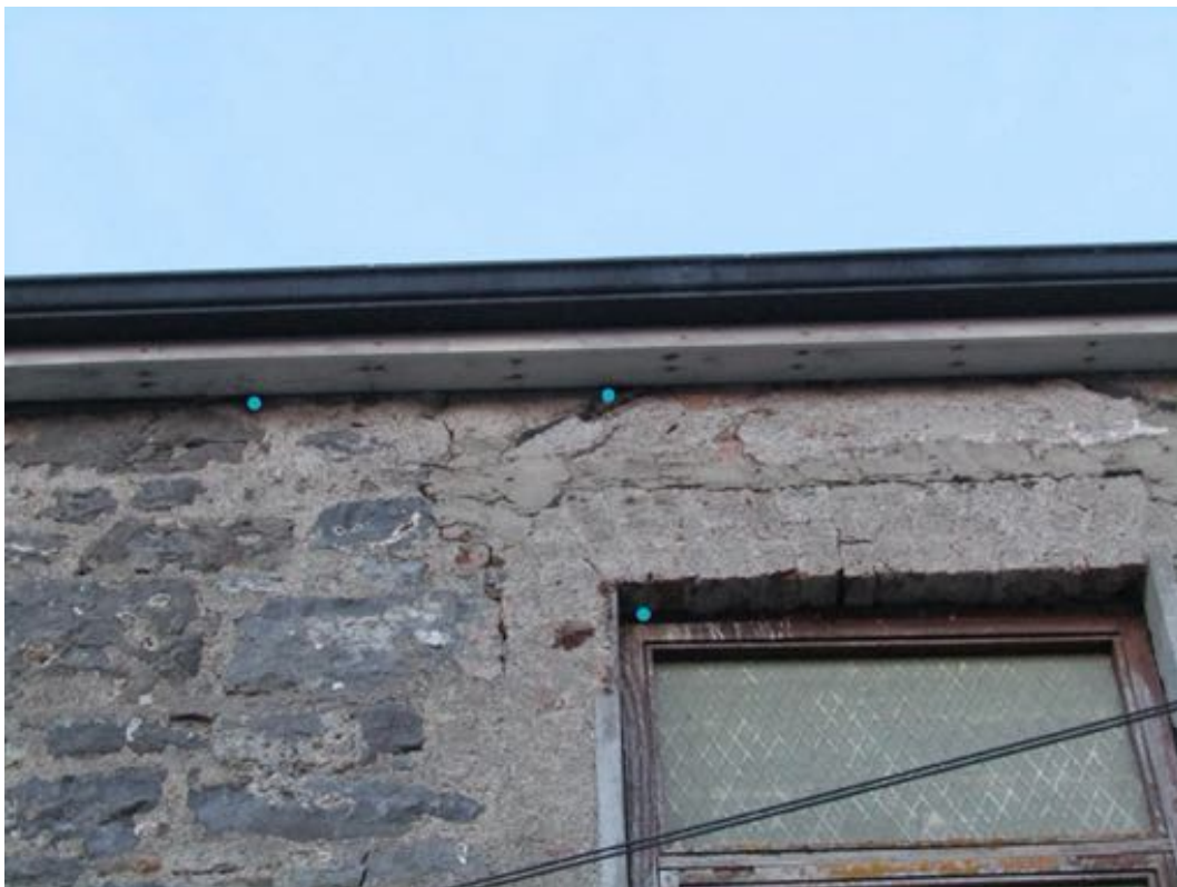
Nests 13,14,15, Youth Centre (exact).