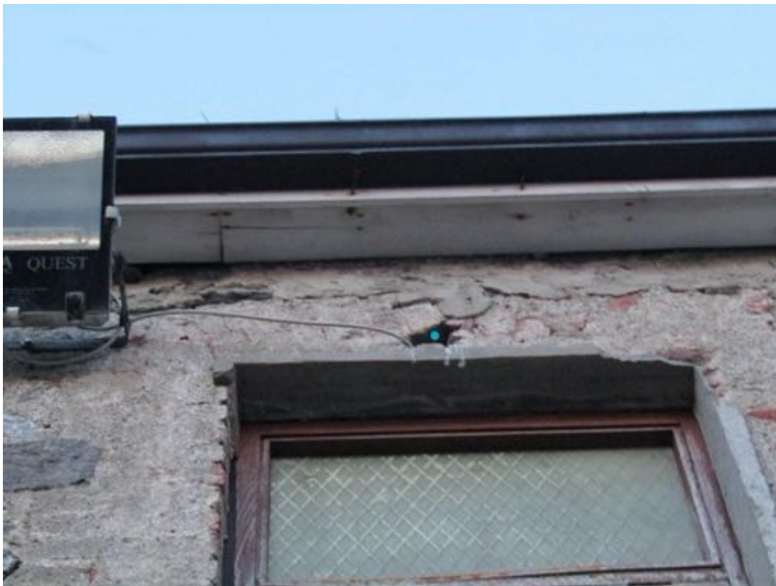
Nest Number 9, Youth Centre (exact).