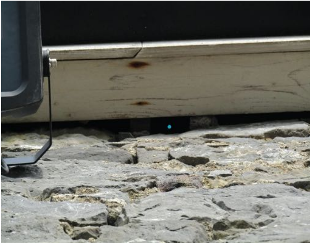
Nest Number 1, Youth Centre (exact).