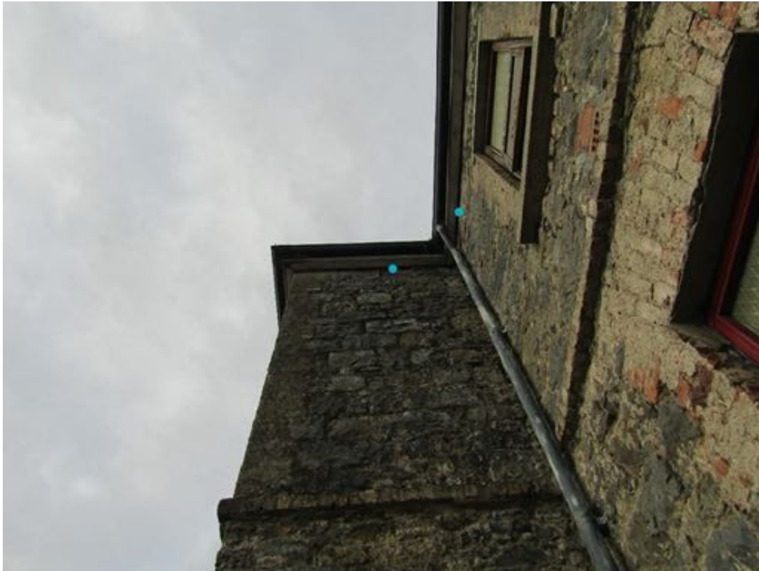
Nests 3+4, Youth Centre.