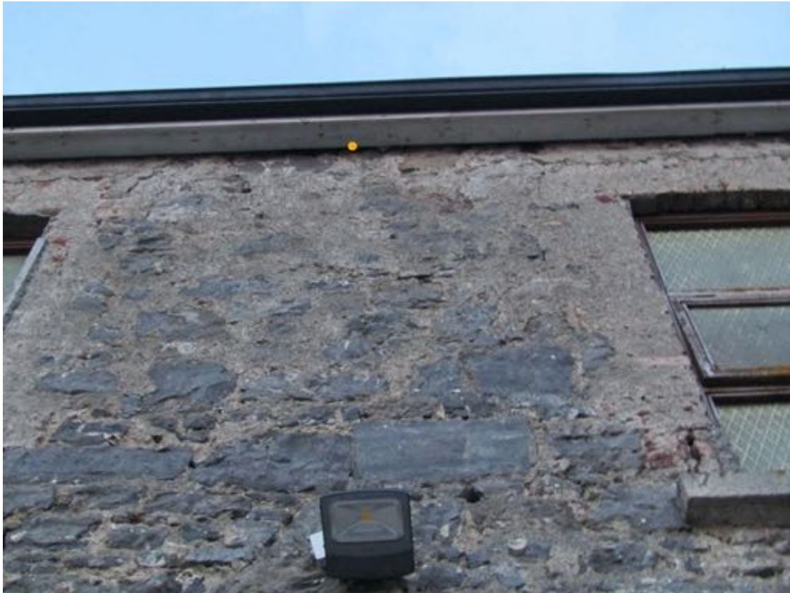
Nest Number 10, Youth Centre.