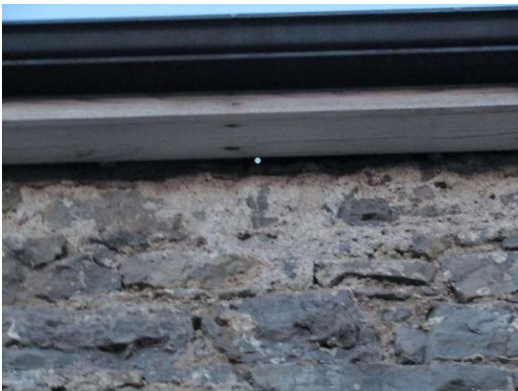
Nest Number 2, Youth Centre (exact).