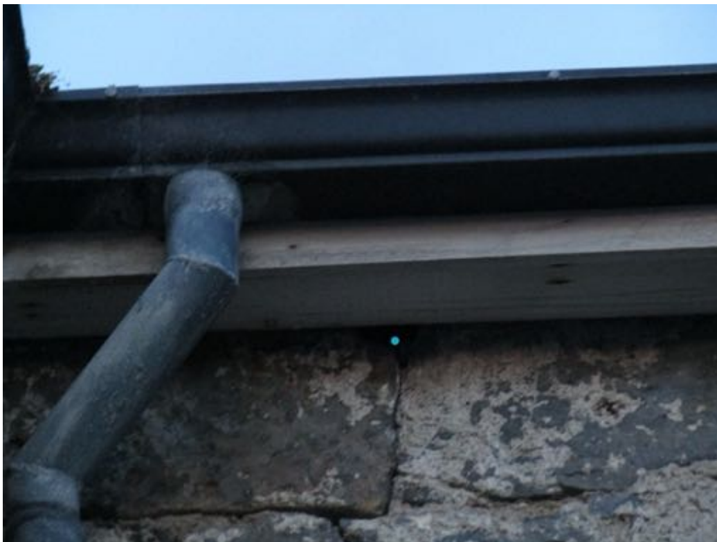
Nest Number 4, Youth Centre (exact).