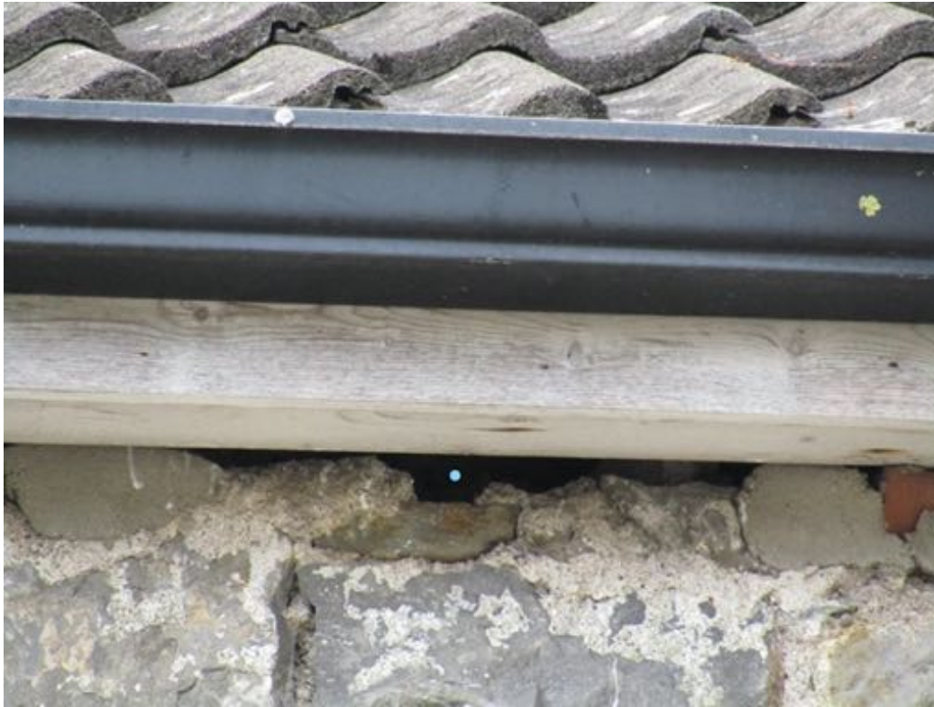
Nest Number 3, Youth Centre (exact).