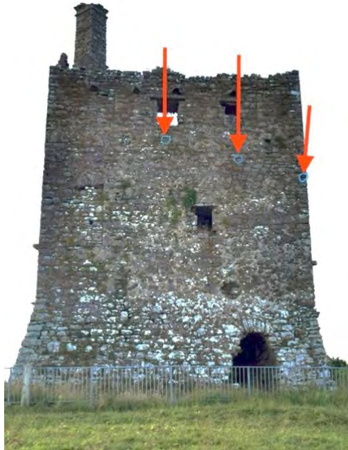
North facing 2024