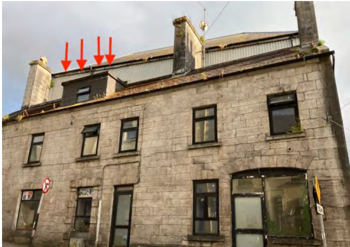
New nest site found on Main St (front of building)