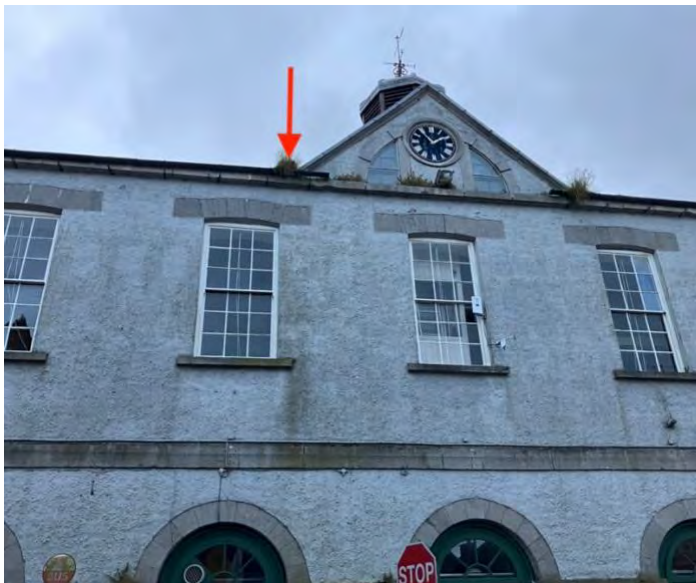
Rear of building lots of ivy – no Swifts seen entering nest sites