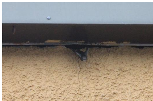
Bird exiting natural nest

In 2015 one Schwegler Triple Cavity nest box (with 3 nest boxes in the one unit) was erected during 'Mayo Swift Week' organised by Heritage Officer and Swift Conservation Mayo. In 2019 a pair of swifts using the left hand nest box