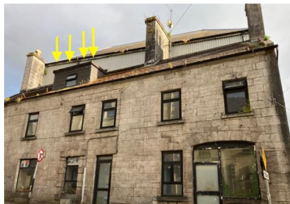
1c. The 2024 survey confirmed 4 occupied nest sites