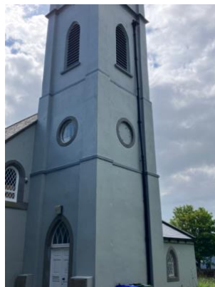
2c. Project completed and attraction calls playing from 2024