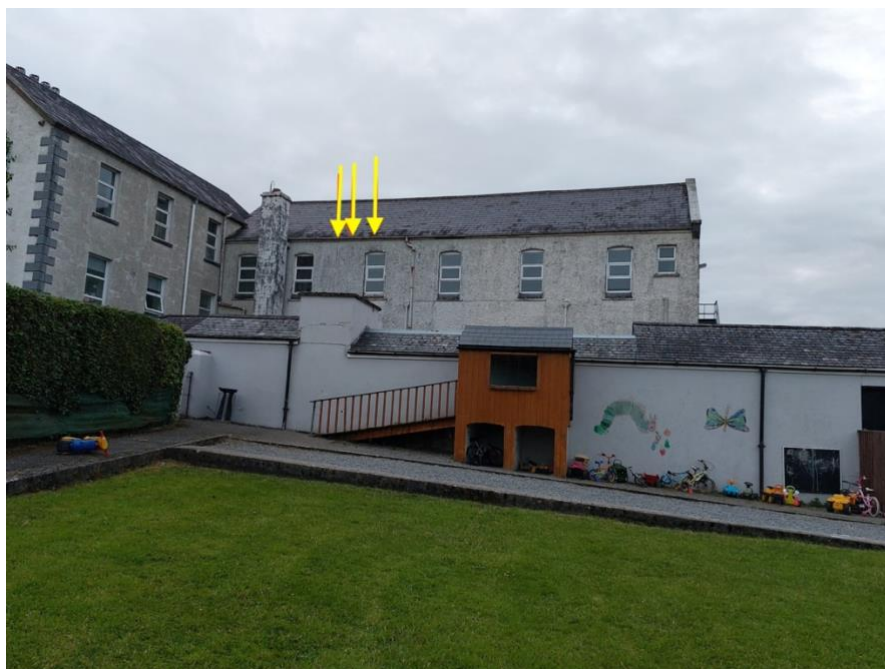
7a. S facing with three natural nests