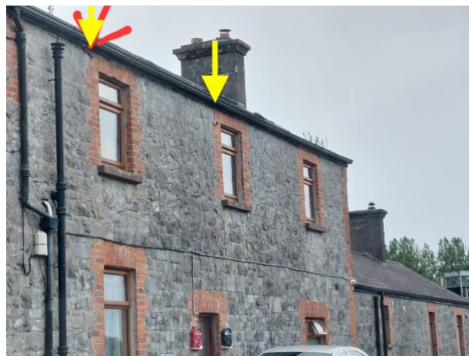
3a. Front of building facing NE with 2 occupied nests in 2024.