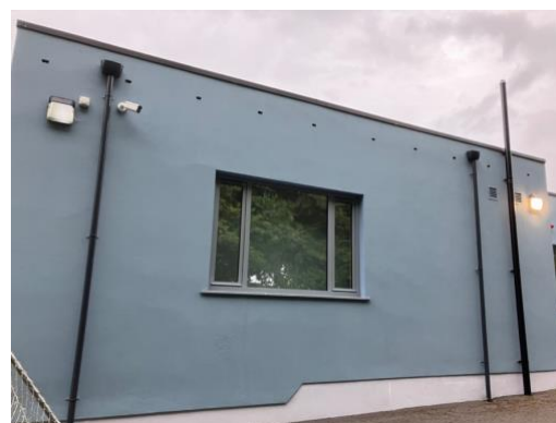
6c. E aspect with 10 nest boxes and attraction call speaker