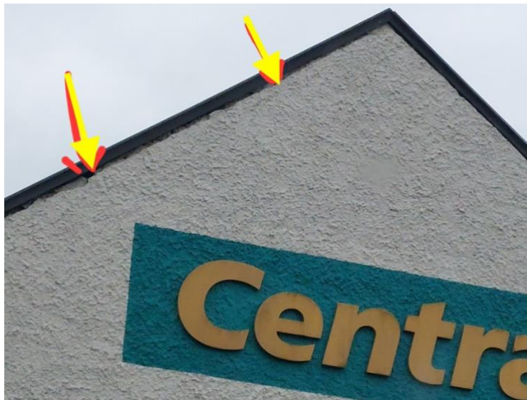
4a. North facing aspect with 2 natural nests