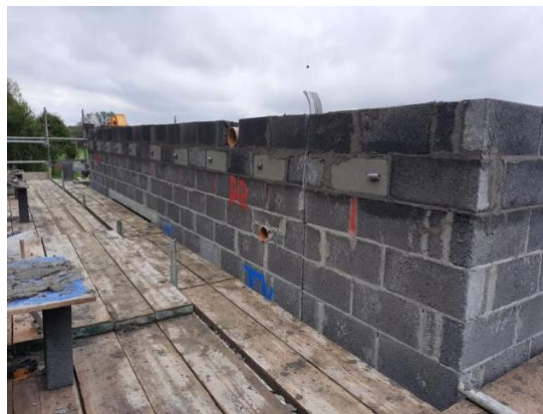
6a. Vivara Woodstone GZ03 nest boxes being built into the new school extension in 2020

The school added an extension in 2020 and 18 Vivara Woodstone GZ03 nest boxes were built into two walls. The calls were switched on in 2021. Birds have been seen flying over the school but nest boxes are not yet occupied. The lights near the nest boxes operate on motion detection but are turned off by the caretaker during the Swift breeding season.