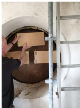
2a. Bespoke nest boxes

In 2021 renovation work was carried out to the Public library (ex St Mary's Church). Four bespoke nest boxes were built into the west facing side of the tower under the supervision of the Heritage Officer. They have built-in cameras. Calls playing from July 2024