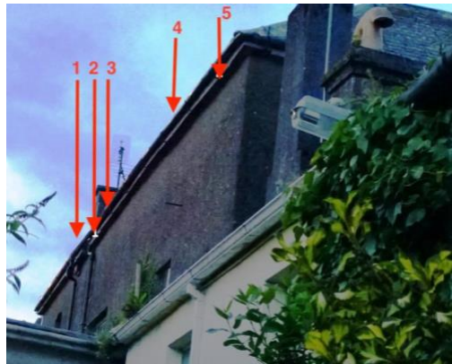
1a. BEFORE THE REROOFING IN 2018 there were 5 occupied nests at rear of building facing NW. After the reroofing NO Swifts seen using these nest sites and this was confirmed during the 2024 survey.

Re-roofed in October/November/December 2018 - supervised by Mayo County Council Conservation Architect. The work was carried out in collaboration with Swift Conservation Mayo to try to retain the swift nest sites but these efforts were only partly successful on the North facing wall but not successful on the NW facing wall. Pre the 2018 reroofing there were 14 nest sites in this building but in 2024 only 5 occupied nest sites were recorded - see images 1b and 1c below.