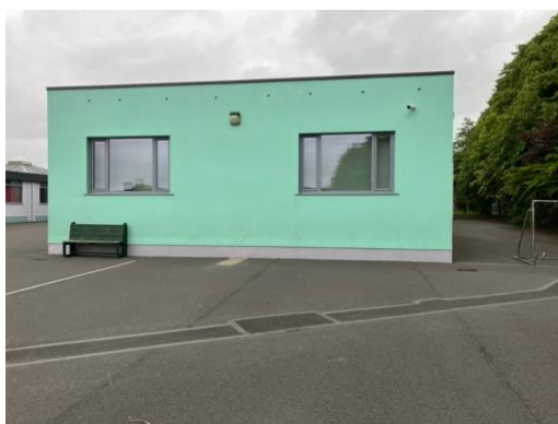
6b. S aspect with 8 nest boxes