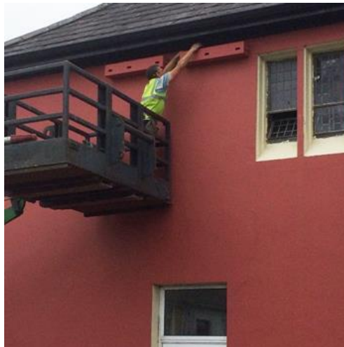
5a. Two Genesis triple nest boxes being installed in 2016. No occupancy to date.

Two triple cavity Genesis swift nest boxes were erected at the Parish Centre in April 2016 with attraction calls. Permission to erect the boxes was granted by the Conservation Architect of Mayo County Council. A small info board has been erected at the site. This project was realised in collaboration with Ballinrobe Tidy Towns. There was no confirmed nesting at this nest box project in the 2024 survey.