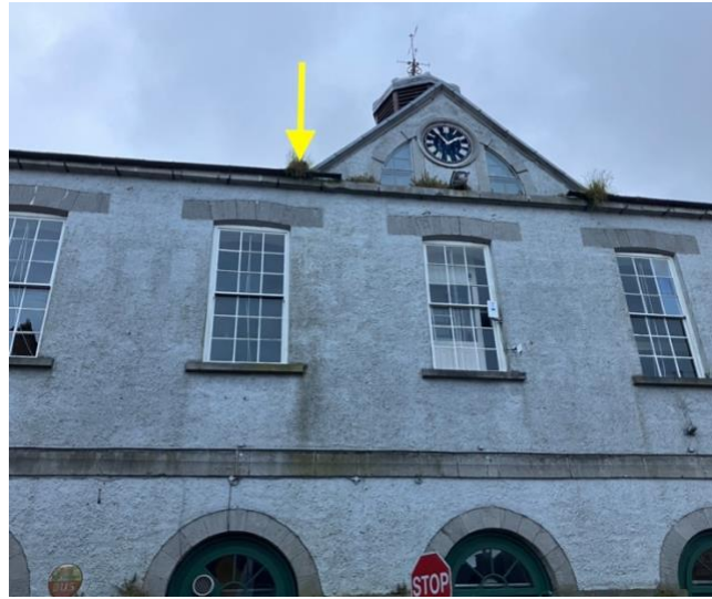
1d. One new site recorded in 2024 at the front of the building facing E