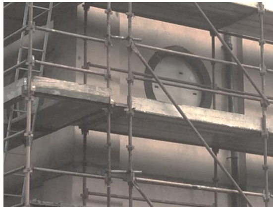
2b. external view of nest box entrances