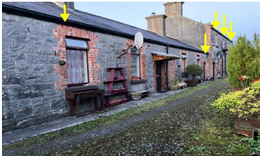
3b. Rear of building facing SW