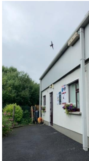
1a. View of Swift prospecting the nest box in 2023

One Genesis triple compartment nest box was installed in 2019 with attraction calls. One Swift has been seen approaching the nest box on several occasions in 2023 but not observed in 2024.