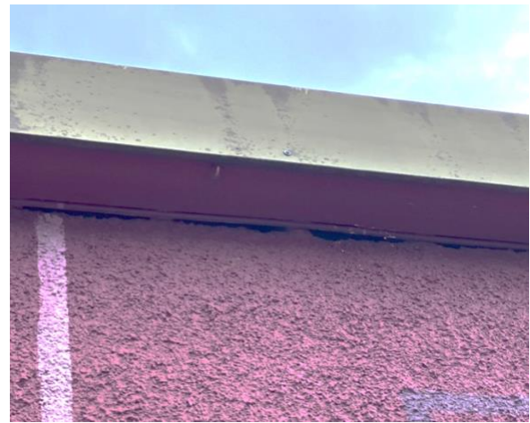
4b. Swiffs enter natural nests in small gaps where the wall meets the soffit

In 2015 one Schwegler Triple Cavity nest box (with 3 nest boxes in the one unit) was erected during 'Mayo Swift Week' organised by Heritage Officer and Swift Conservation Mayo. In 2019 a pair of swiffs using the left hand nest box and in 2024 two nest boxes in use – see 4d. below.