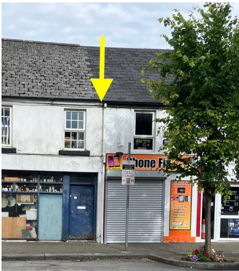
2a. E facing natural nest site. Entrance is to the left of the downpipe.