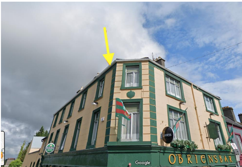
5a. There is one natural nest site accessed behind the fascia board.