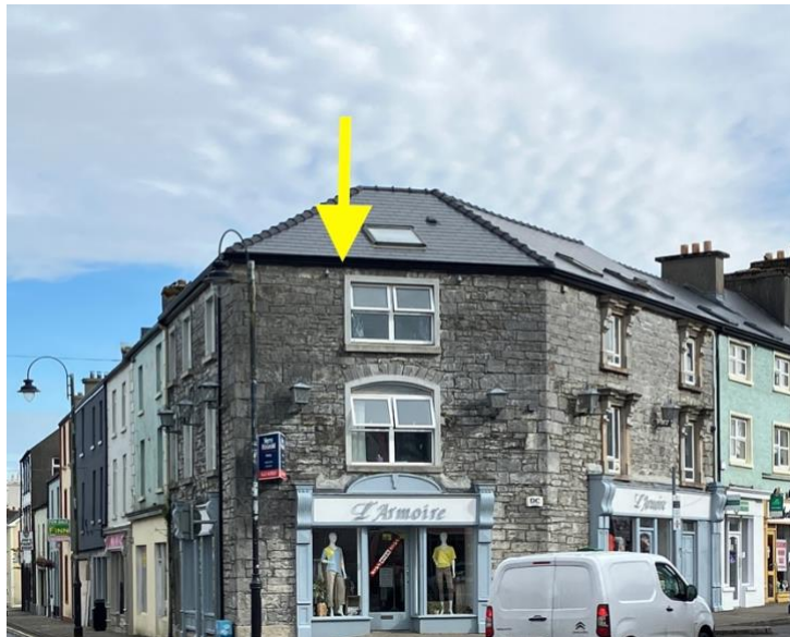
1a. one occupied nest site on the South facing side which faces onto the junction with Dalton Street and Mount Street.

Prior to 2024 there were 4 nest sites identified in this building, however, during the 2024 survey only one nest site was observed to be in use – see image below – despite being surveyed on several occasions by three different surveyors.