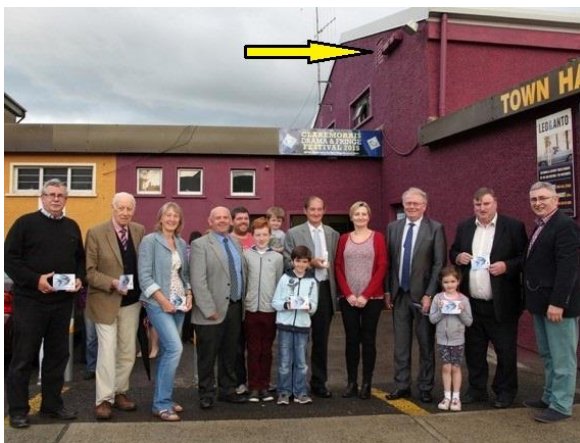
4c. 2015 Mayo Swift Week group photo

In 2015 one Schwegler Triple Cavity nest box (with 3 nest boxes in the one unit) was erected during 'Mayo Swift Week' organised by Heritage Officer and Swift Conservation Mayo. In 2019 a pair of swiffs using the left hand nest box and in 2024 two nest boxes in use – see 4d. below.