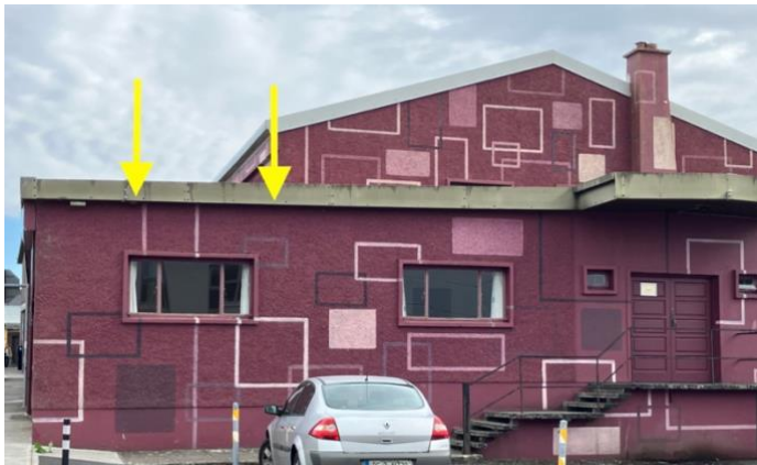
4a. SE facing – two natural nests