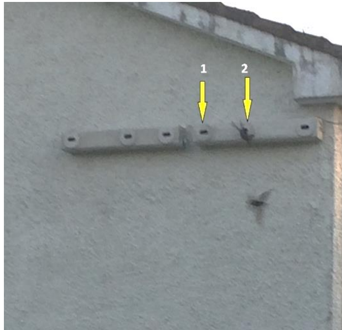
3a. Two active nests in 2024

Nest boxes erected in 2014 with six cameras installed linked to a tv in the school entrance hall.