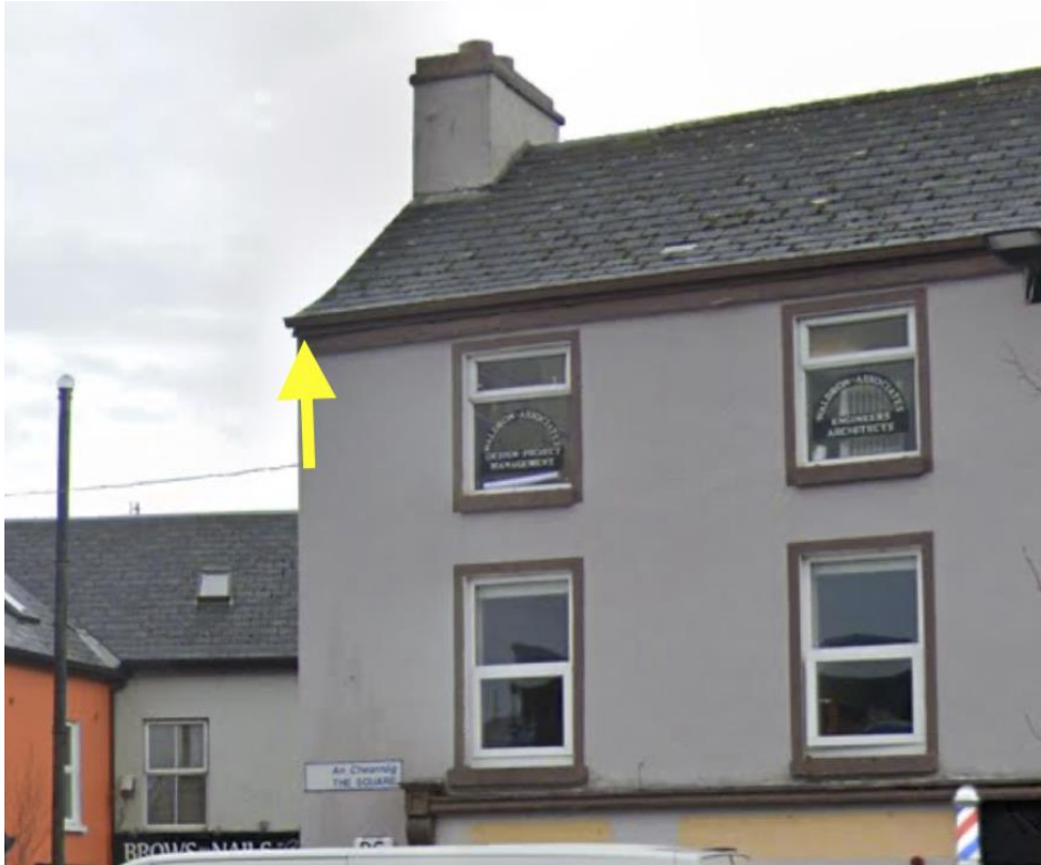
6a. One natural nest site – bird’s access wall plate through a small gap behind the fascia board