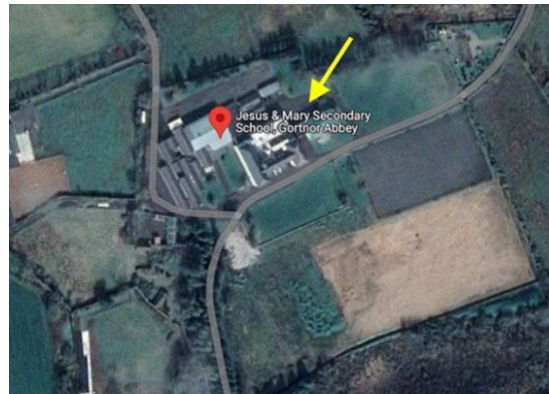
3a. aerial view the school. The yellow arrow marks the location of the nest boxes.

The old part of the building is as listed structure but there are no Swift nest sites there. However, in 2022 the school built an extension and incorporated 11 VivaraPro built-in nest boxes. The project was completed in 2023. The nest boxes are built into the back wall of the new extension