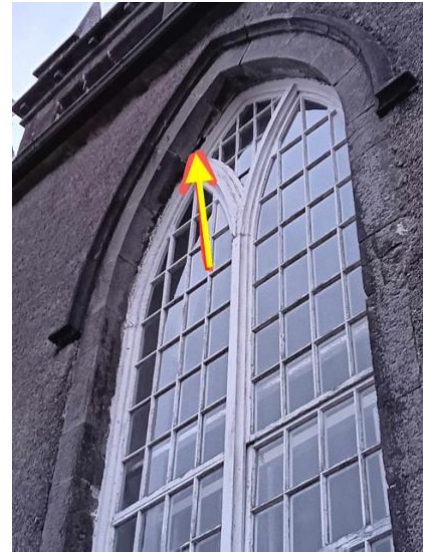
1c. close up of nest entrance