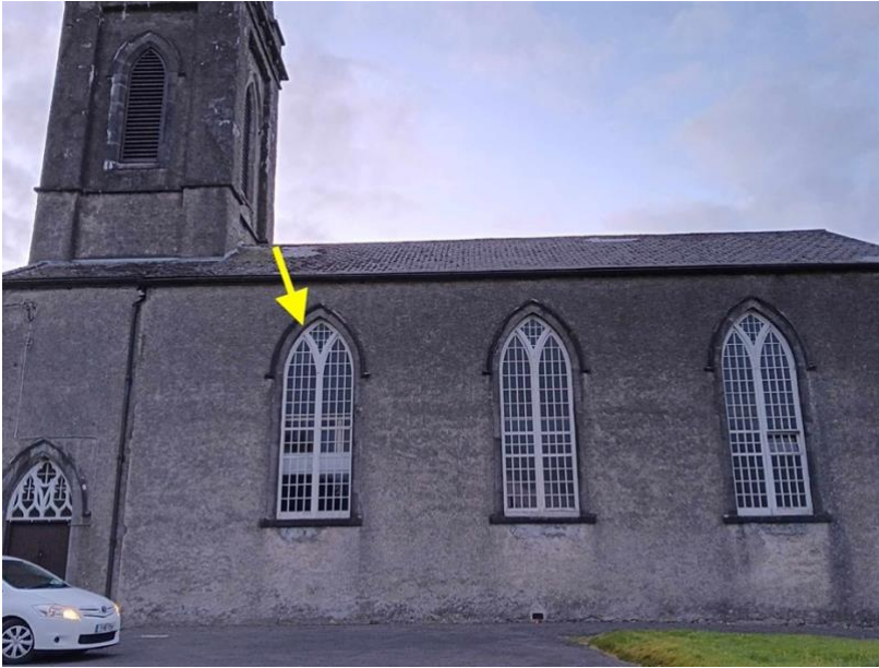
1b. East facing – one natural nest at edge of window frame