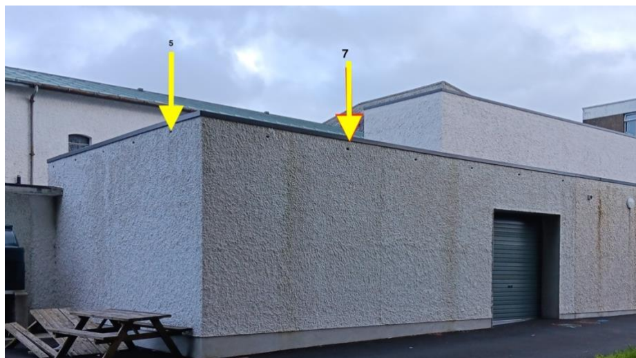
3b. Two occupied nest boxes – one North facing and one East facing