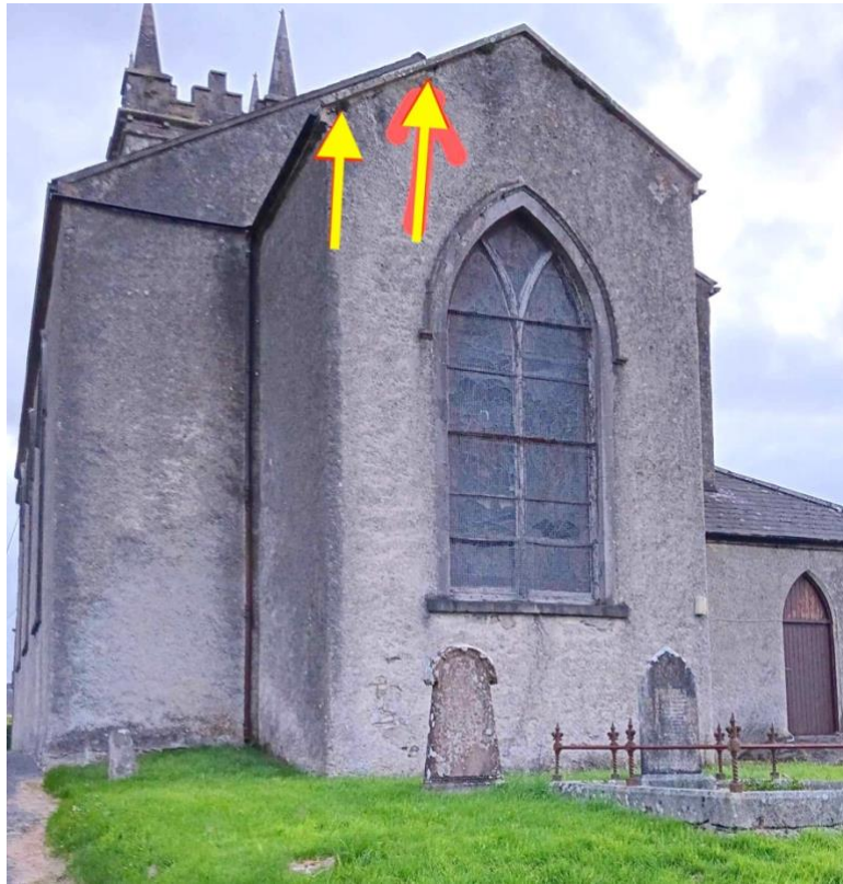
1a. North facing