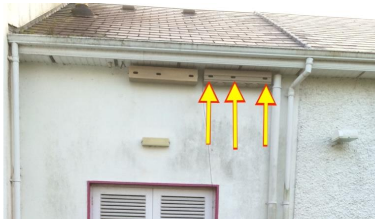
2a. East facing external nest boxes with the three right hand nest compartments occupied in 2024

In 2021 the school had an extension added and 5 Vivara Pro GZ10 nest boxes were built into the south facing gable.