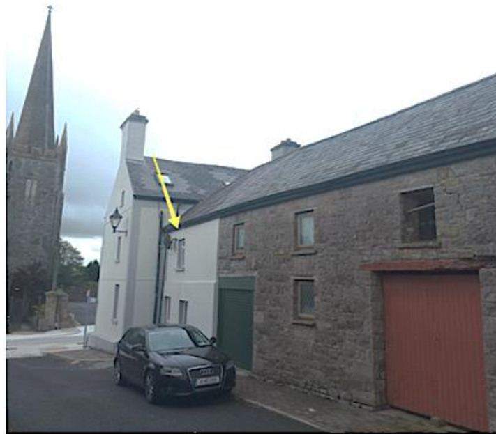
2a. East facing – one natural nest

This site is across the road from Site 1 – The Old Deanery