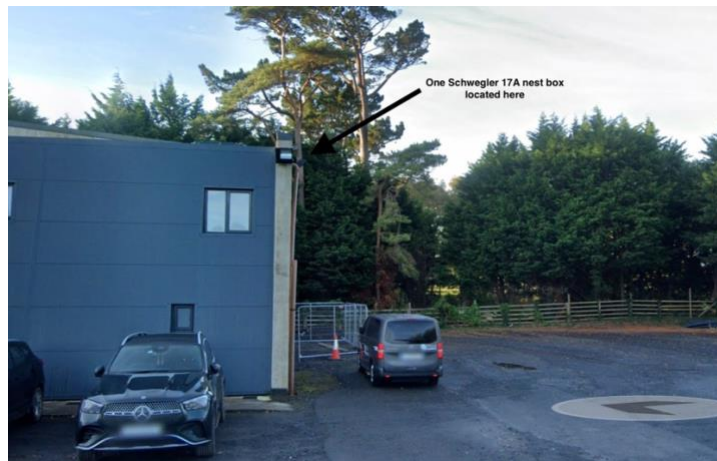
3a. Black arrow shows location of nest box

In 2023 one of the nest boxes was removed when external cladding was added to the building. There is still one nest box there but no sign of Swift activity in 2024