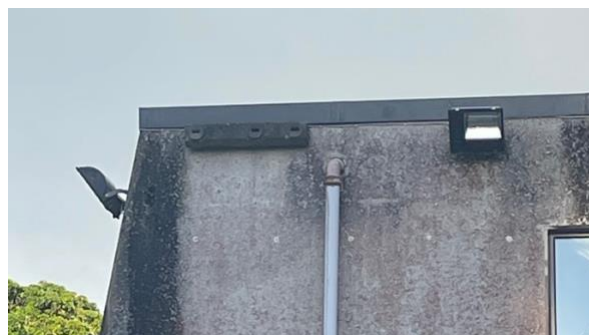
3b. close up photo of nest box