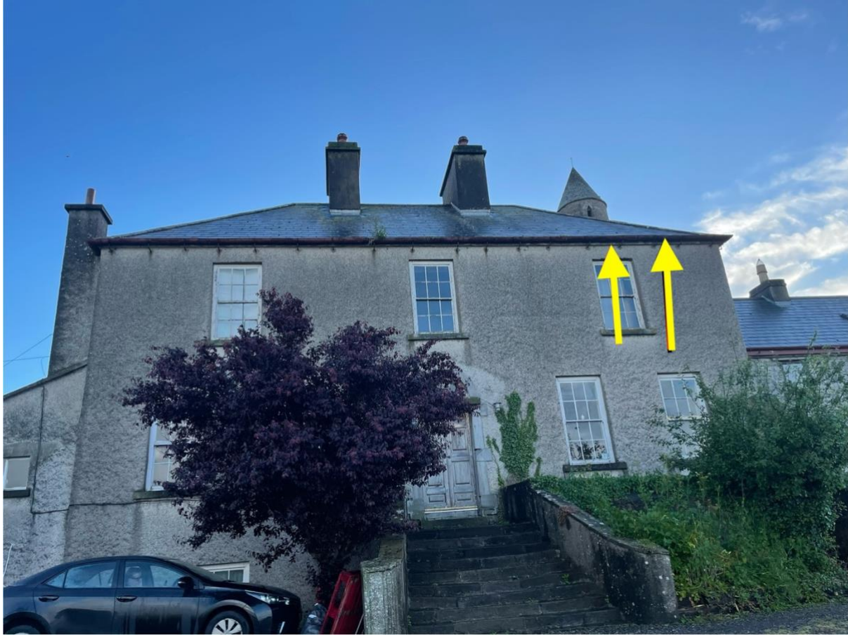
1b. East facing (front of building) – two natural nests