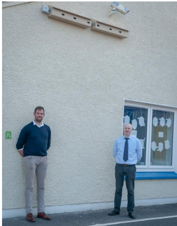
1b. North facing – Genesis nest boxes

Nest boxes installed at the school in 2021 and funded by Gary Smyth.