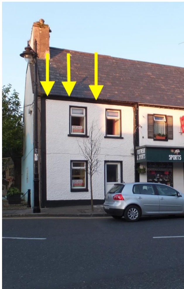
1a. West facing onto Main street at corner with Barrack St

This property was purchased by the Newport Development Association in 2018 and they are aware that Swifts nest in this building. The guttering on this building is still original.