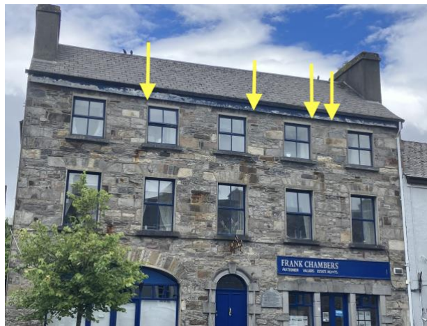
2a. West facing onto Main Street