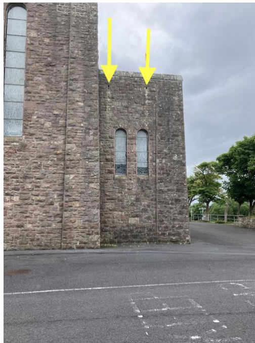
3c. East facing to the right side of the building