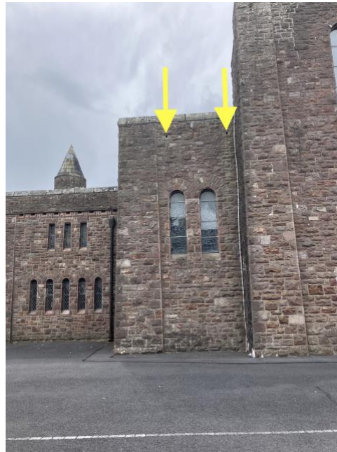
3b. East facing to the left side of the rear of the building