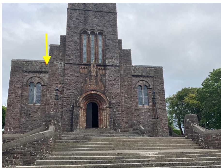
3a. West facing front of church