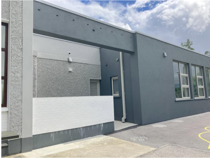
4b. North facing – nine built-in nest boxes. Calls playing from July 2024