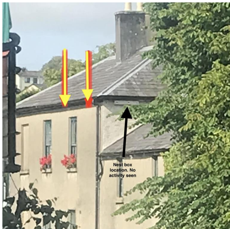
4a. South East – two natural nests.

There are no attraction calls playing at the nest box and to activity has been seen.