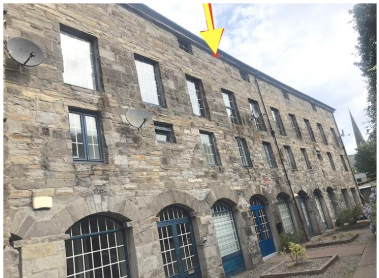
10b. South East facing – one nest site half way along the building