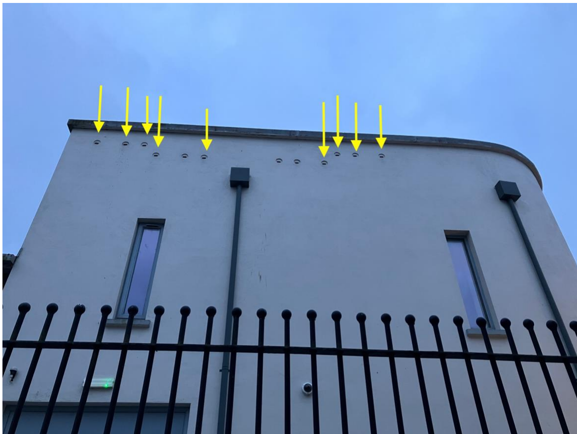
6a. North facing – 9 occupied built-in nest sites