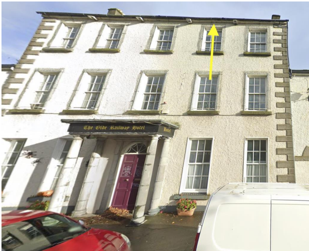
5a. South facing – one nest site