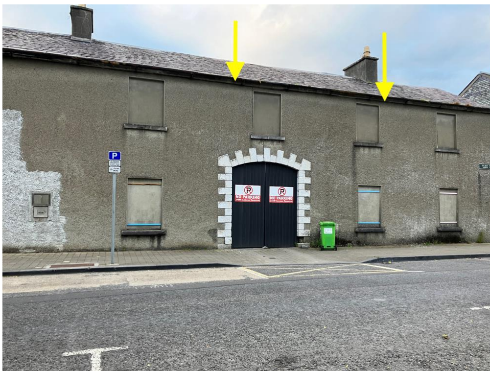
3a. North West facing – two nests