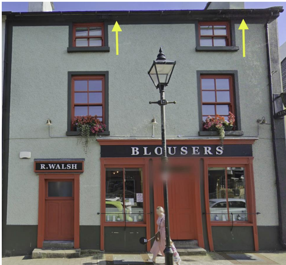
2a. North West facing – two nest sites