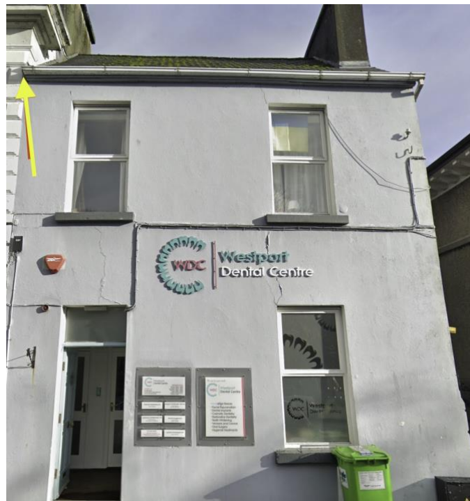
8a. South West facing – 1 nest site