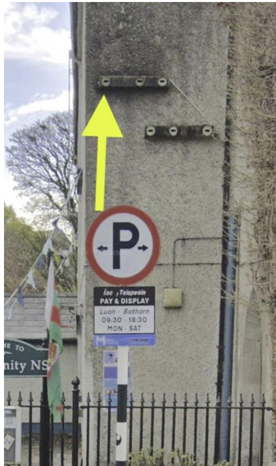
7a. North West facing – 1 nest compartment occupied in 2024