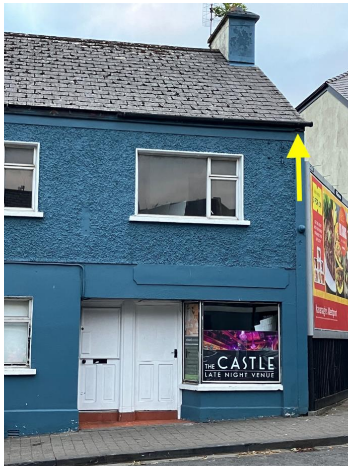
11a. South East facing – one nest site

This nest site was discovered for the first time during the 2024 survey.