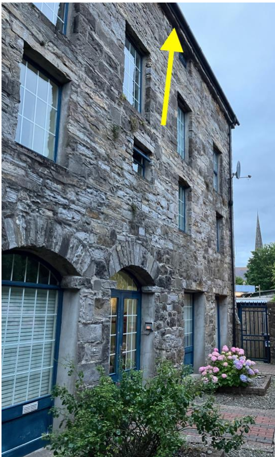
10a. South East facing – one nest site at far right

This converted water mill has lots of gaps in the stone work near the fascia, the entrance to these nest sites is via a crack in the stone work.