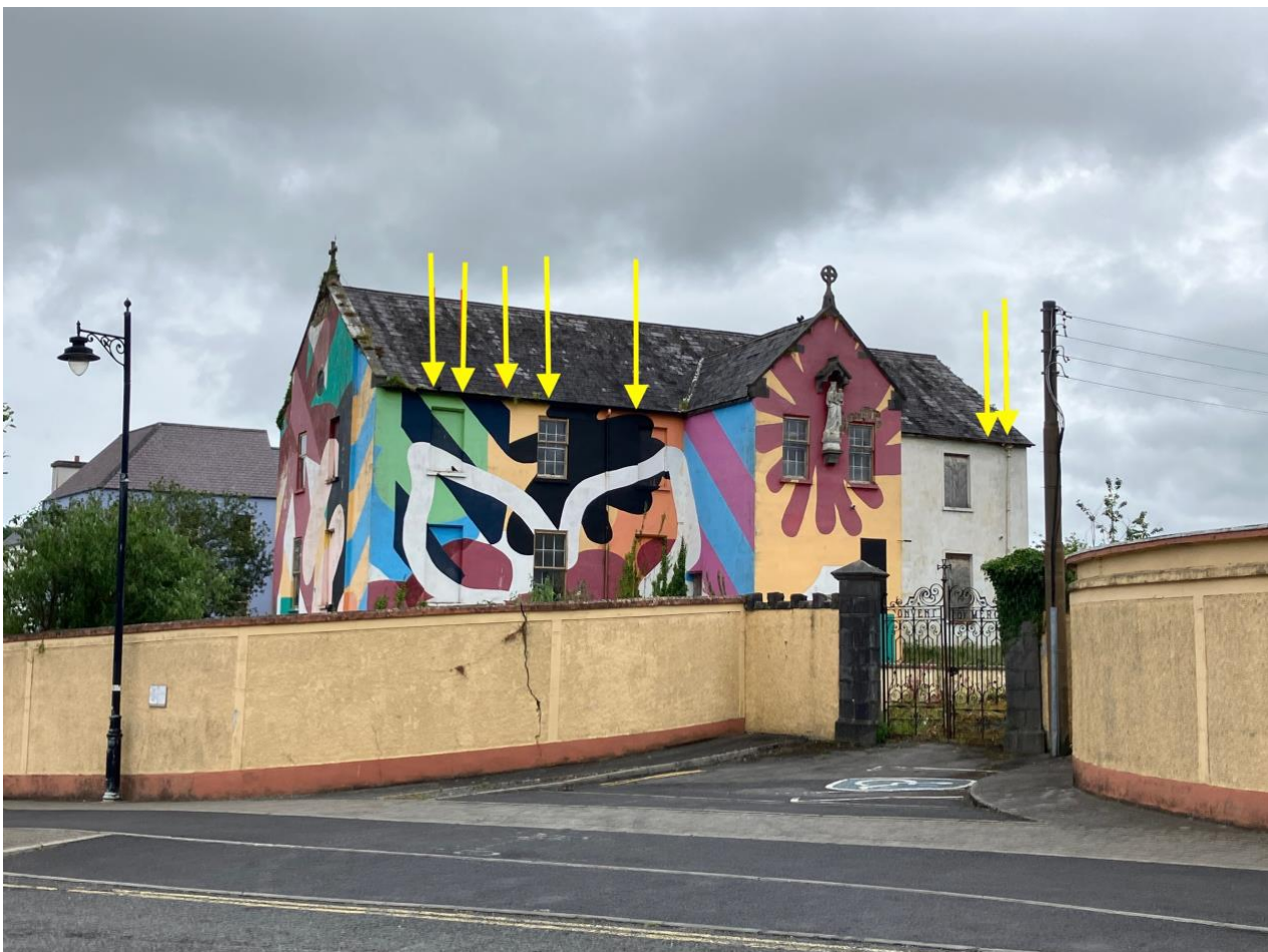
1a. South East facing – 7 nest sites

There used to be 27 nest sites in this building on four sides but in the 2024 survey there were only 7 active nest sites.